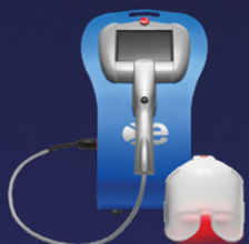
POWERHOUSE WITH OPE® IPL and LM LLLT