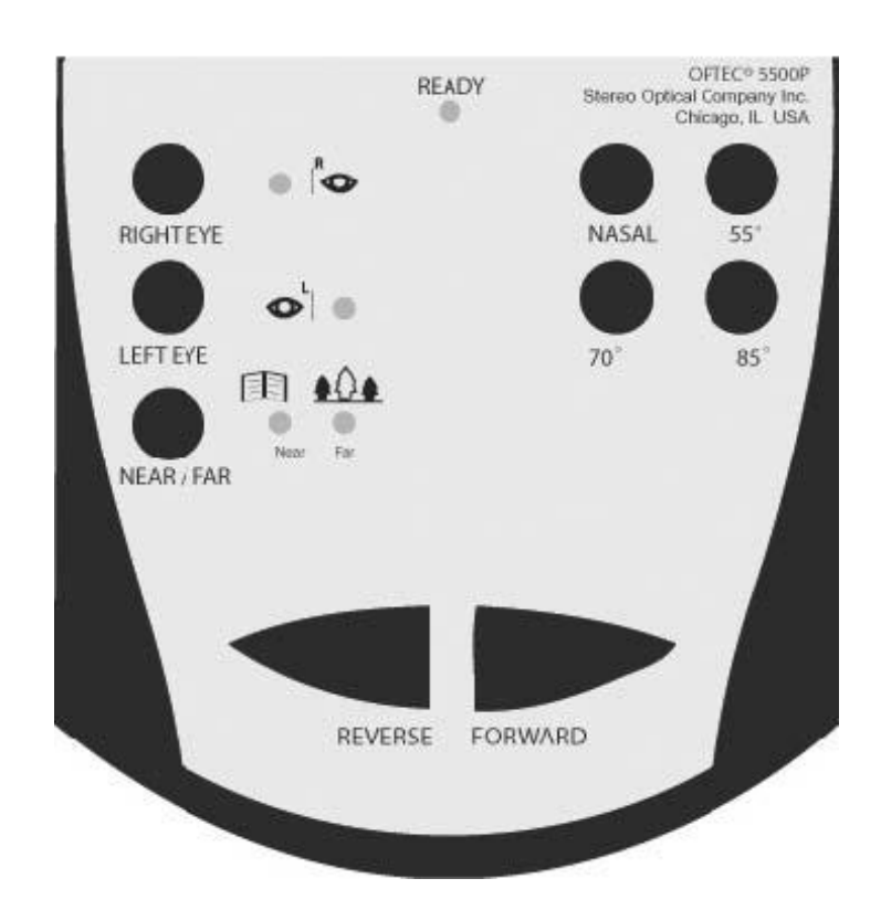
Remote Control Panel Model 5500P Motorized Tester

This switch determines direction of the slide advancement. Pressing this switch once advances test slides one at a time. Holding this switch down allows for continual advancement of the test slides until the desired slide is in the correct position.