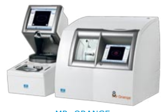
MR. ORANGE Raising the standard of efficiency with precision and high-end comfort