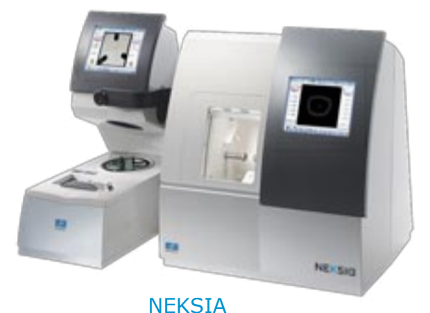
Racing through your workload with the next-generation KAPPA