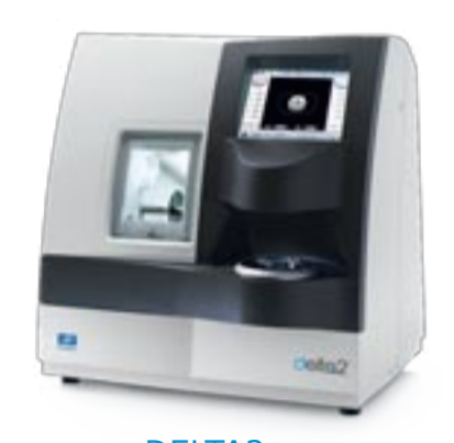
DELTA2 Covering all the essentials to reinvent simplicity

Essilor Instruments makes in-house finishing easier and more profitable to help you grow your practice. Our finishing offerings range from the all-in-one Delta2 system to the trusted Neksia, and premium Mr. Orange and Mr. Blue edging systems: